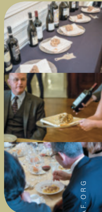
Some of the white truffle and wine lots on display for auction (top); while potential bidders took a closer look (middle); and guests dined on pasta with shaved Alba white truffles.