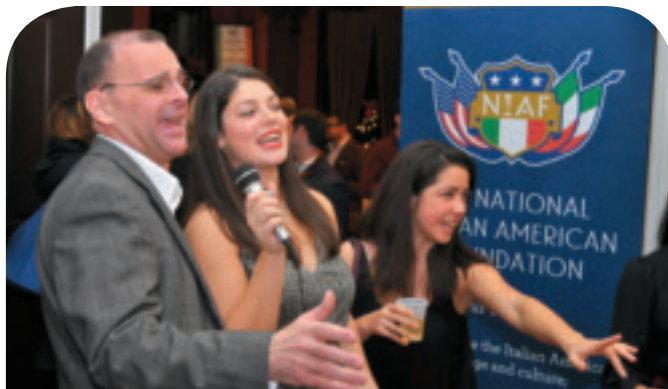
Karaoke is a Christmas Open House tradition at NIAF Headquarters!