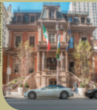
The Union League in Philadelphia